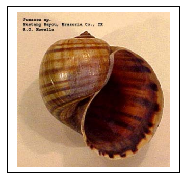
Applesnail from Texas with a channeled shell (Pomacea sp.)

Identification of applesnail species can be difficult and ongoing DNA studies show that "channeled" applesnail introductions include multiple species. Florida applesnail ( Pomacea paludosa ) is native to the U.S. Spiketop applesnail (P. bridgesii) from South America has been introduced elsewhere. The channeled applesnail-group (P. canaliculata-group) may include 3-15 species with channeled shells. True channeled applesnail (P. canaliculata) from South America, has been introduced in Hawaii, the Philippines, and elsewhere. At least some populations of the "channeled" applesnail-group ( Pomacea spp.) introduced in Texas and Florida are not P. canaliculata, but are one of the other channeled species (exact identity yet to be determined). Titan applesnail (P. haustrum) from South America has been introduced in Florida; it has not been found elsewhere in the U.S. and now appears to be less related to the channeled applesnail-group than long thought. Giant rams-horn has only a single species. Dealers also use the old name Ampullaria cuprina & A. gigas for any larger, channeled species.