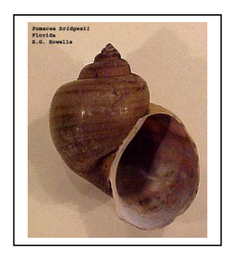
Spiketop applesnail (Pomacea bridgesii)

The American Fisheries Society uses applesnail as one word, but apple snail is often used by others. In the aquarium trade, applesnails are usually sold as mysterysnails or mystery snails, but true mysterysnails are in another family. Pet trade dealers sometimes call large specimens giant or Peruvian apple snails. Throughout much of Southeast Asia, the Indo-Pacific, members of the channeled applesnail-group are often known as golden apple snails (also golden kuhol, golden snail, and miracle snail). When applesnails were first taken to Taiwan, they were promoted as "golden apple snails" to represent how much money snail growers would make raising them for Asian escargot. "Golden" was a marketing ploy and not necessarily an indication of snail color. But, use of the term "golden apple snail" has gained wide use outside the Americas. It remains important to recognize that "golden" can be both a color variety and a species (or group of species). Giant rams-horns have also been called Columbian rams-horns and it too may occur in gold and albino forms.