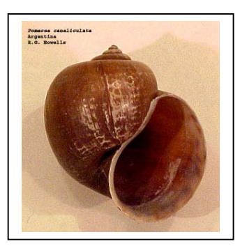
Channeled applesnail (Pomacea canaliculata)