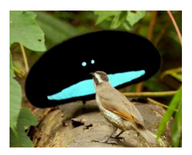
From Cornell Lab of Ornithology