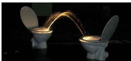
Part of Ping's toilet fountain by night

Have you ever wanted to say something like that in a NABS talk or a paper? Did you get into your field at least in part for the thrill of discovery and the wonder of nature? In addition to science, the more imaginative ways of interpreting the natural world (e.g. art, creative writing) are important means of communication and understanding. At least this is what some new programs to pair artists and scientists are arguing. This blurb is the first of a 2-part (or more, if more examples emerge!) series highlighting such programs in the realm of benthology. Our first subject is Ping Qiu of the Swiss Art-