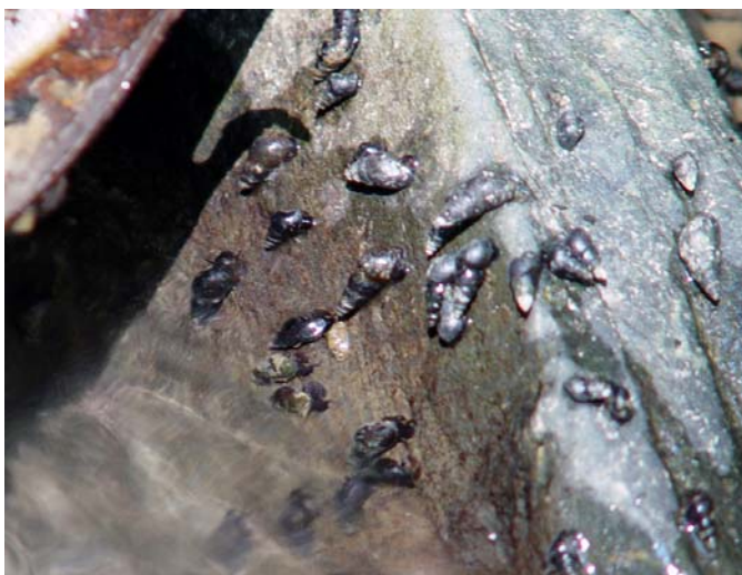
Goniobasis proxima: locally abundant in S. Appalachians.